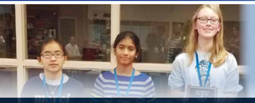
Our District's academic program provides opportunities for all students to reach their full potential.